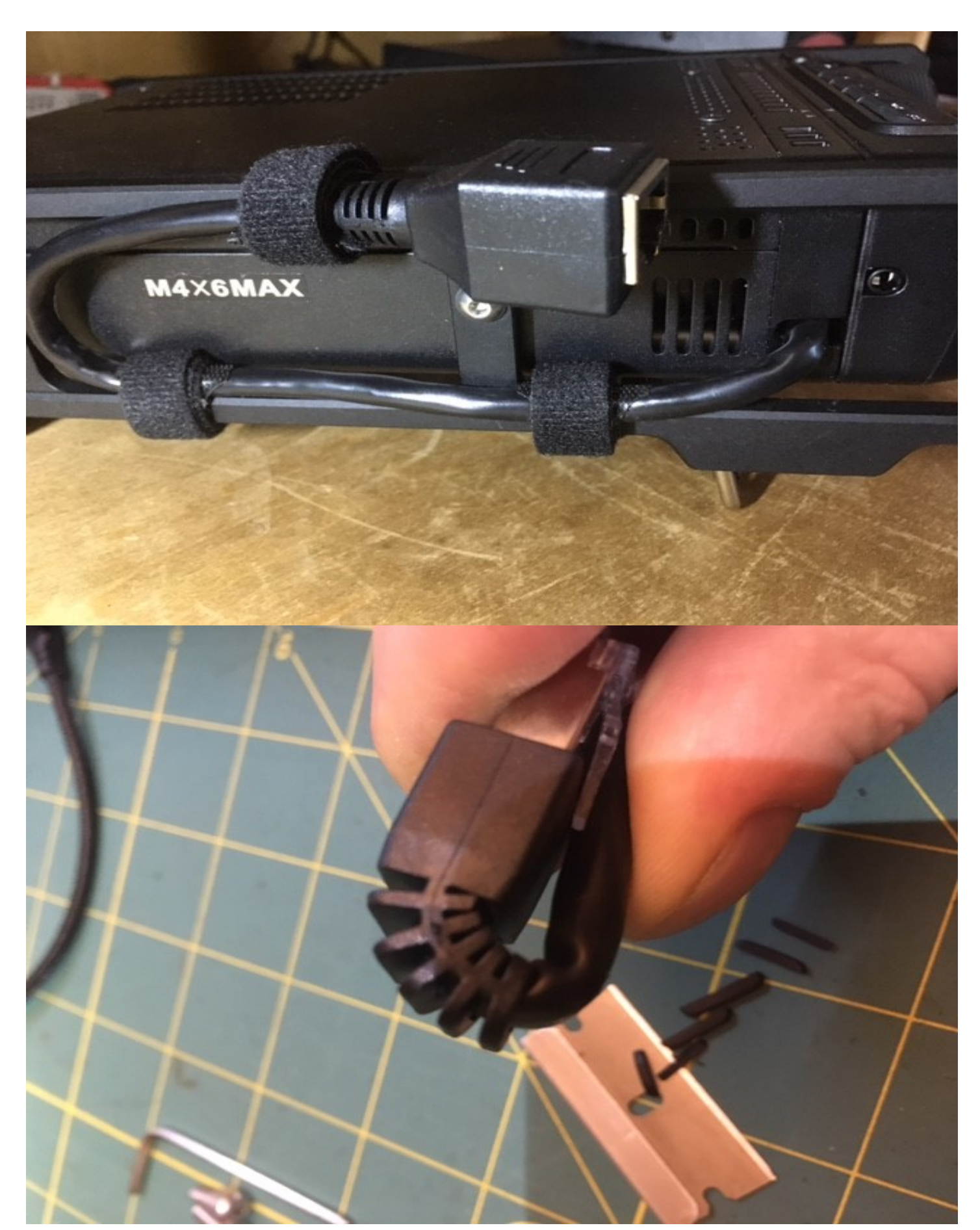
Back to Contents